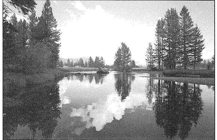
The Wild & Scenic Tuolumne River

A year ago The Tuolumne River faced a Water System Improvement Program (WSIP) that would have allowed the diversion of an additional 25 million gallons of water per day – enough to fill 1,000 swimming pools, every day. Fortunately for the River, on October 30 the SFPUC approved an alternative program, the Phased WSIP, which will cap water sales at current levels until 2018 and focus on water conservation and recycling rather than on any additional diversions. This was a huge victory – the first time we've ever had a cap on sales. We've changed the way the SFPUC does business!